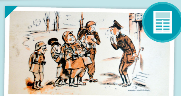
Cartoons like this made fun of the enemy.

In the days before television, people got a lot of their news from the radio. War leaders used radio to give rousing speeches. The enemy tried to spread fear with fake news, but it often seemed far-fetched and not believable.