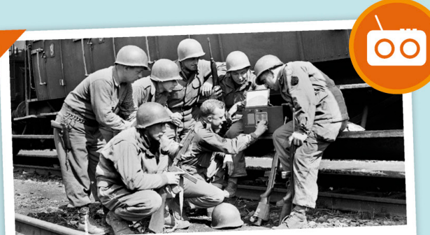
American soldiers listening to news from back home.